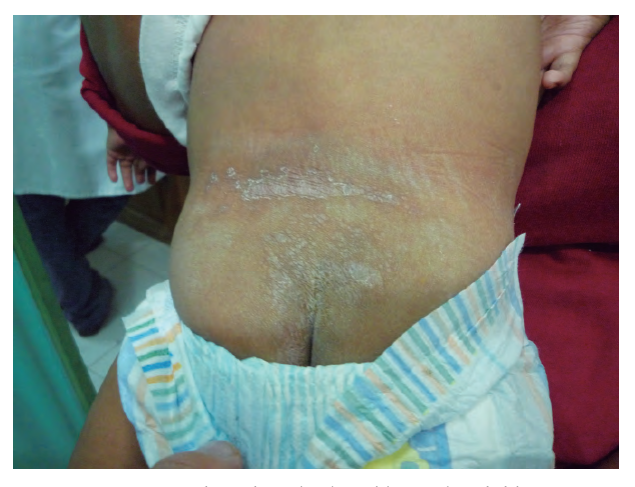
Figure 3. Scaly rash on back and buttocks, child B, 11 months old.

Cutaneous manifestations are present in over two thirds of the cases of early CS<sup>3, 4</sup> and are most commonly developed between the second and the eighth week of life <sup>4</sup>, as in the two cases reported herein. These usually start as small blisters on the soles, the back and the back of the thigh (Fig 1-2-3), later changing to persisting copper-colored flat or bumpy rash <sup>2</sup> (Fig.