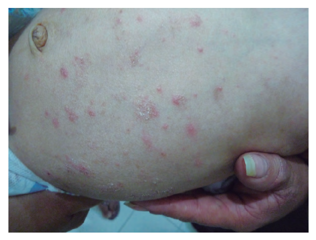
Figure 1. Maculopapular scaly rash, child A, three months old.