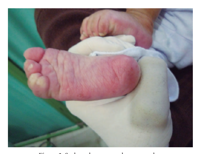
Figure 2. Scaly rash upon erythema on soles, child A, three months old.