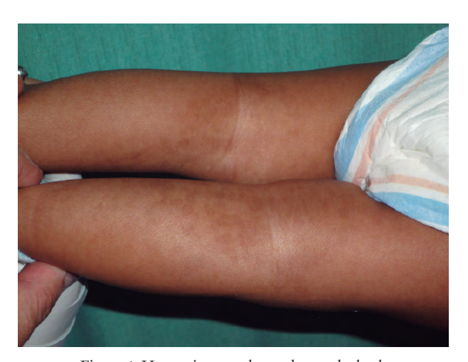
Figure 4. Hyperpigmented macules on the back of the legs, child B, 11 months old.

4). Other symptoms in NB include anemia and rhinitis (present in one of the cases), hepatosplenomegaly, periostitis and/or osteochondritis, neurosyphilis, leukocytosis and thrombocytopenia<sup>3, 4</sup>.